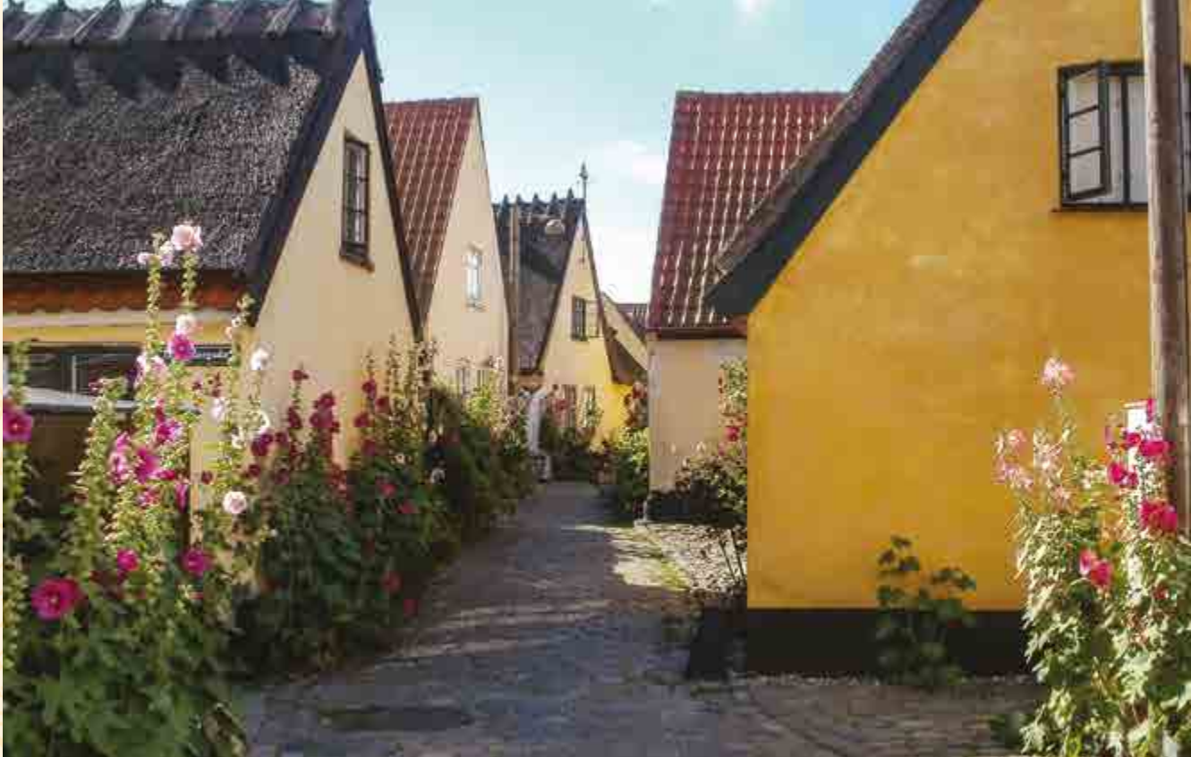
The gables of houses in the “lanes”- stræder. Photo: Jan Engell, 2016