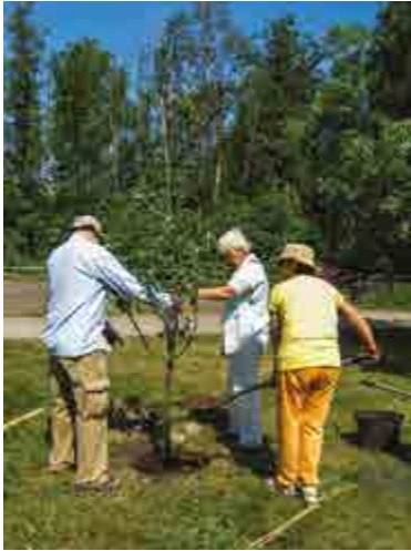
Planting trees with fellow residents in the city.

Some of the more tangible lessons learnt in promoting a proactive culture with the municipality include the following. First, have an officially acknowledged structure, such as an NGO, which is capable of taking legal responsibility. Second, have an egalitarian and utilitarian agenda, and try to get all the likeminded people on board. In many cases, representativeness is crucial for the city. A municipality can rarely fulfil the demands of a marginal group. When you have your NGO together, understand your municipality and collaborate with the right people.