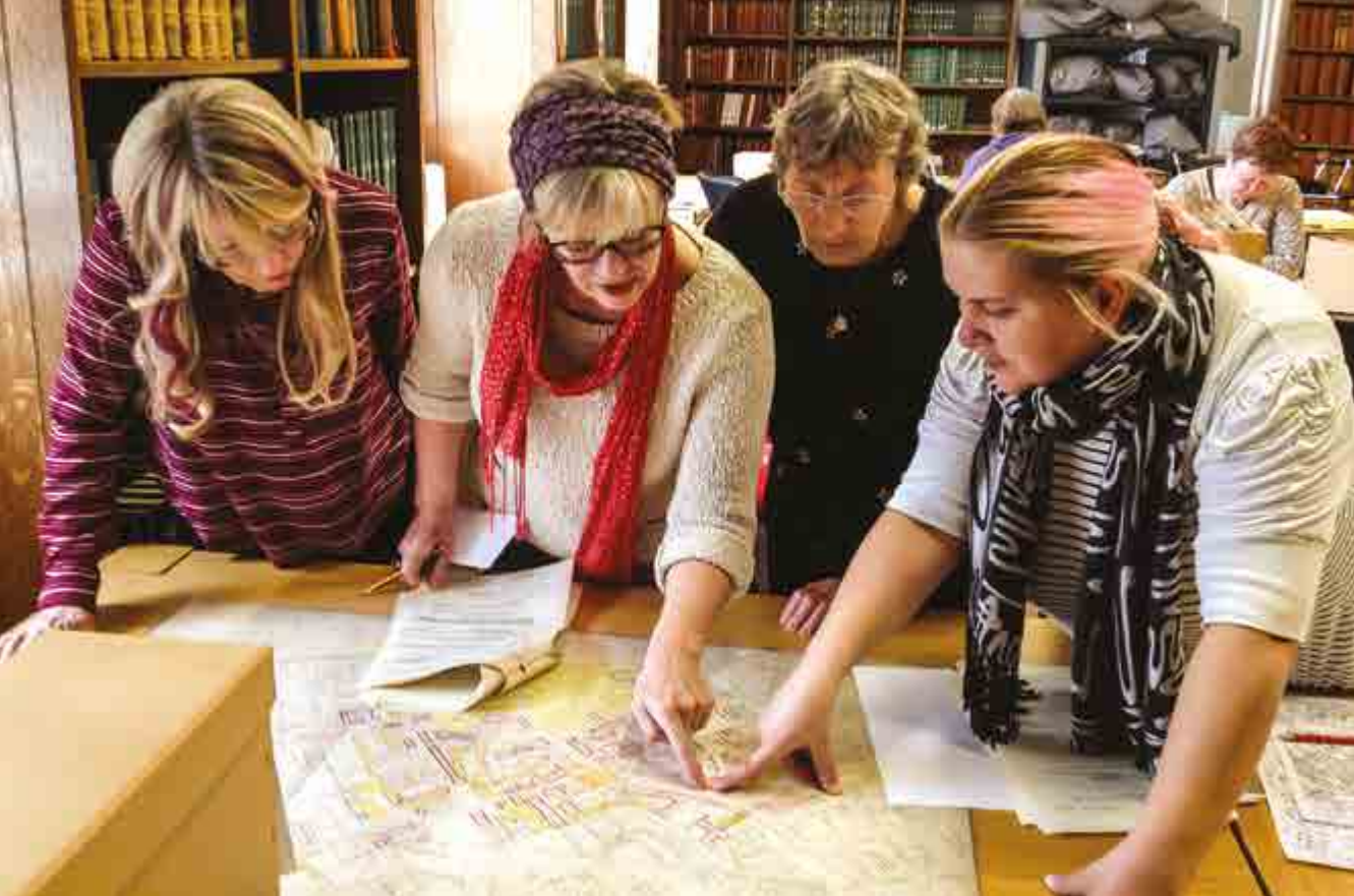
York Past and Present members look at archives on the city's 'slum clearances' and new social housing estates in the mid-20 th century.