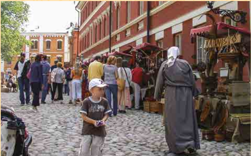
Medieval Market in Turku, Finland

Stephenson, Janet , 2010, The Dimensional Landscape Model: Exploring the Differences in Expressing and Locating Landscape Qualities, Landscape Research 35 (3), 299–318. http://www.tandfonline.com/doi/abs/10.1080/01426391003743934