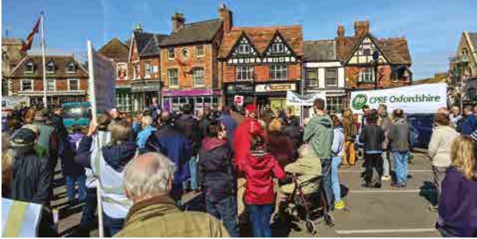
A rally in the Square of the small Oxfordshire Market Town of Wantage.

behind, and Councils can no longer afford in these straitened times to employ the manpower to monitor the developing situation closely enough.