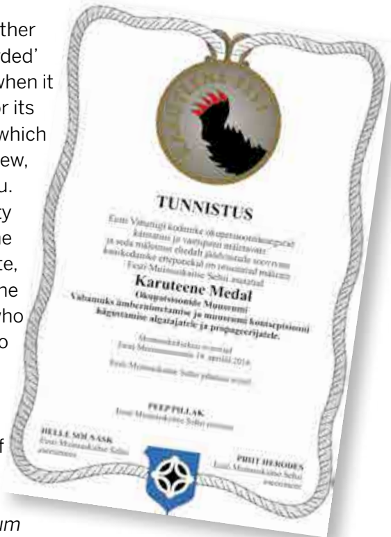
Karuteene Medali Tunnistus – The Lemon Prize Diploma

At first, it was the Board of the Estonian Heritage Society which decided on the recipient of the Lemon Prize. In recent years, however, we have enlisted help from the general public as any institution or individual can propose its candidates. The board of the Estonian Heritage Society makes the final choice. In general, one Lemon Prize has been issued per year, sometimes two in exceptional cases, but there have been years without any nominees at all. This always comes as a great disappointment to the media, as journalists are much more interested in the winner of the Lemon Prize than in those numerous people who deserve true recognition. The Lemon