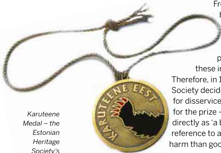
Karuteene Medal – the Estonian Heritage Society's Lemon Prize.

Therefore, in 1997 the Estonian Heritage Society decided to establish its Lemon Prize for disservice in the field. The Estonian name for the prize – Karuteene medal – translates directly as 'a bear's service', which is a reference to a Slavic fable about doing more harm than good with one's actions.