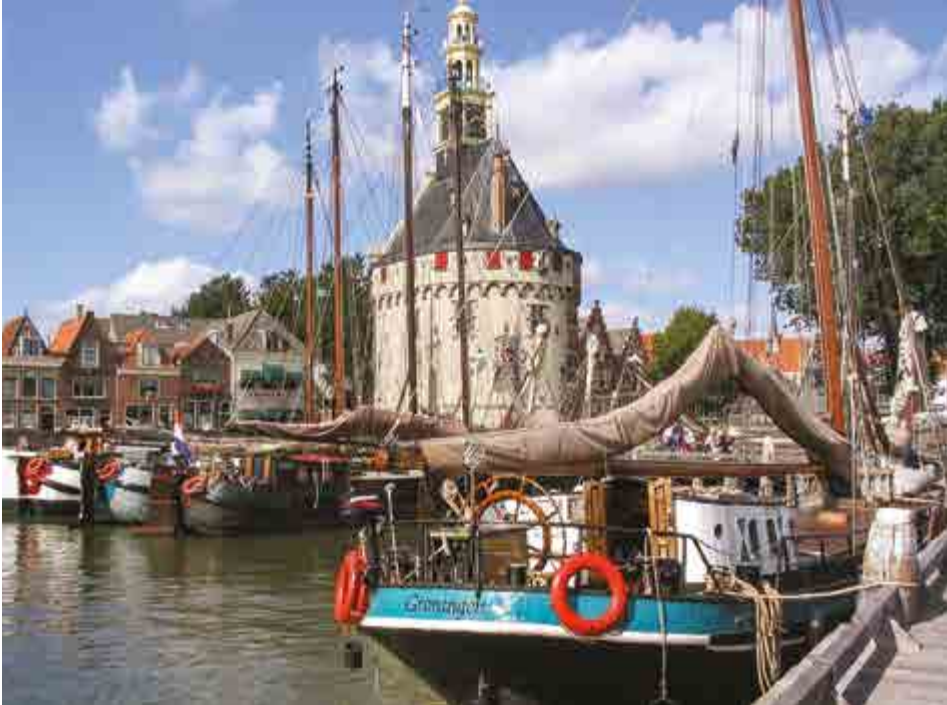
The city of Hoorn in West-Friesland was one of the cities applying in 2016.

of Westerveld, a rural community consisting of several small towns and communities, invited their local organisations to suggest what should be done with the prize.