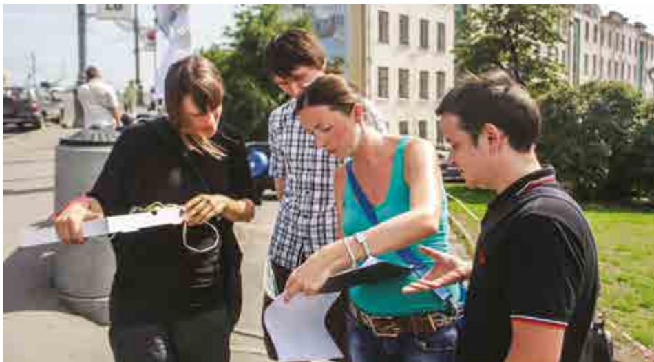
Students guided by Gehl Architects team. Field study.