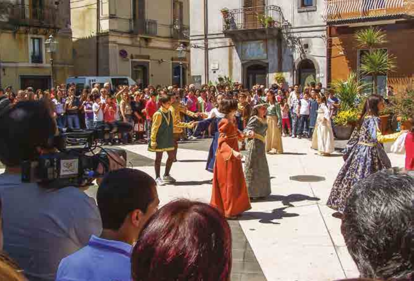
Festive occasion in Randazzo, Sicily when Europa Nostra Congress visited. Secondary school children: traditional dances in traditional costume.

invitation to participate, which involves a statement of interest/registration followed by a more detailed stage of application. The second stage includes the formulation of an action plan based on a small number of achievable objectives, normally supported by the local authority. A nominal fee for overheads may be charged for 'membership' of Project ENtopia. The Europa Nostra Support Team may be available to mentor these stages, also at a nominal cost. However, the engagement of a Place in ENtopia during the first phase is not subject to a fee, but as the project develops to the second phase it will be necessary to agree a local fee contribution to ENtopia.