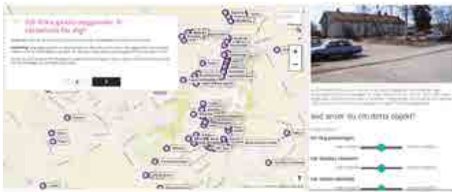
Maptionnaire survey visualizing the cultural heritage objects in Nikkilä, Sipoo, Finland. In the survey, respondents were able to view and evaluate the existing cultural heritage sites and recommend new culturally valuable buildings and landscapes

the gathering of information from people (e.g. web questionnaires and GIS-based mapping tools), and joint design and planning activities (e.g. Geodesign). When it comes to urban planning, these tools enable us to avoid pitfalls in the field of participatory urban planning. Map-based public participation tools (PPGIS) support valuable crowdsourcing information that makes cities wiser. Interaction with citizens not only creates information, but also supports learning and innovation, and instills trust. Maptionnaire is an example of PPGIS that helps cities and other actors to collect, analyse and discuss resident insights into a map. During the last 15 years, cities have started to value and use resident input as an equally important part of their knowledge base for planning.