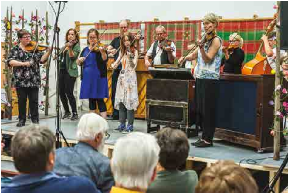
There is a local folk music group in almost every village in Kaustinen. The one pictured goes by the name of Nikulan Pelimannit.

part of the identity of the local people. Not everyone played or danced, of course, but everybody had some kind of connection to the tradition. People participated by listening, joining in with the festivities, providing accommodation for guests from other regions, building venues, selling beverages and so forth.