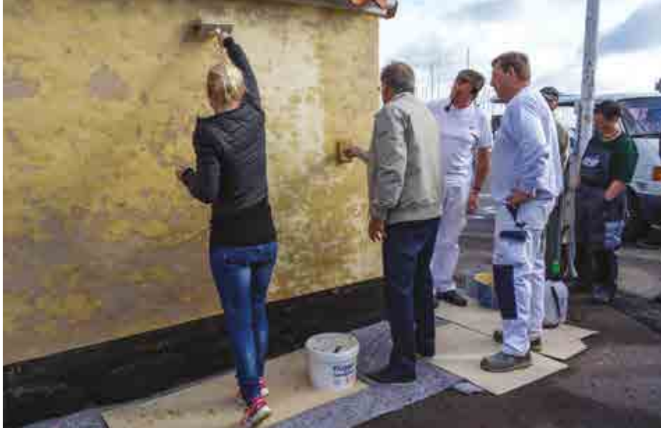
Dragør's house-owners applying lime-wash using traditional materials and techniques under the guidance of two craftsmen.

The town's house-owners have been a powerful driving force in conservation. The efforts towards conservation have their origins in what the townspeople want. The town's inhabitants have themselves taken responsibility and shown respect for the need to follow local building traditions and adapt both new buildings and alterations to existing ones to fit into the historic context, even if this can sometimes be difficult and more expensive. Restoration work has been carried out by house-owners themselves or by local craftsmen with knowledge of traditional methods and materials. From the beginning of the 20 th century, a high degree of awareness has existed about the Old Town's unique cultural history and architectural value. The townspeople and their associations have participated actively in the town's development and preservation.