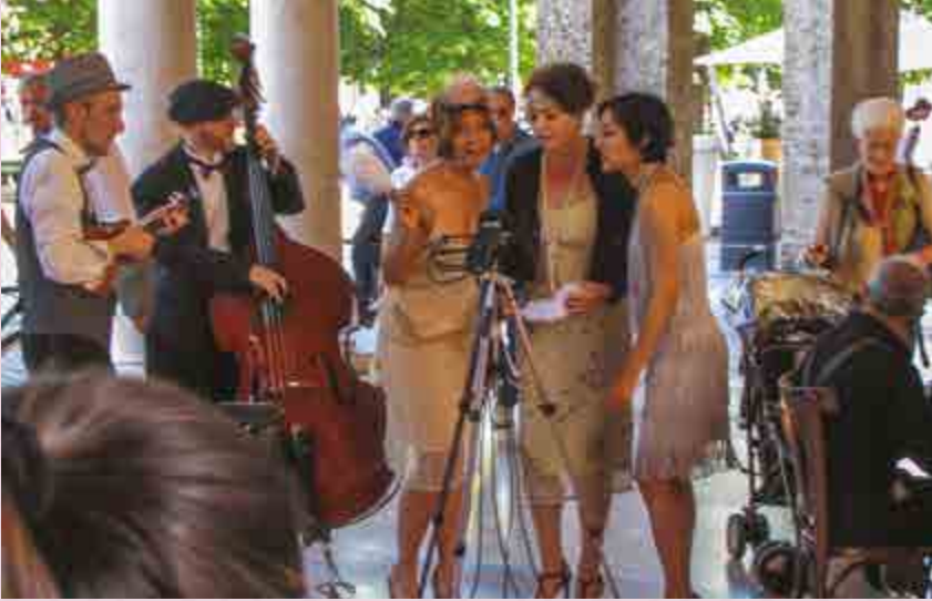
Making music in Bergamo, Italy.