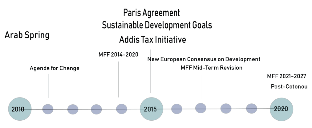
Figure 1: A decade of development policy changes in the EU.

Despite its internal challenges, the EU took a visible role on the international stage post-2015; engaging with the Sustainable Development Goals (SDGs) project and participating closely in the drafting process. Simultaneously it was revising its internal development policy and cooperation models with third countries. The Agenda for Change paved the way for changes to be introduced in the MFF 2014-2020. It was a product of its time with demands for more value for money, transparency on the ways European public money is used, stricter conditionalities imposed on partners, and the spending of development funding where it would have most impact. The policy also adopted stronger rhetoric on inclusive (economic) growth than the European Consensus for Development (2006), which emphasized inclusive development – a small but significant difference indicating the changing priorities of the EU.