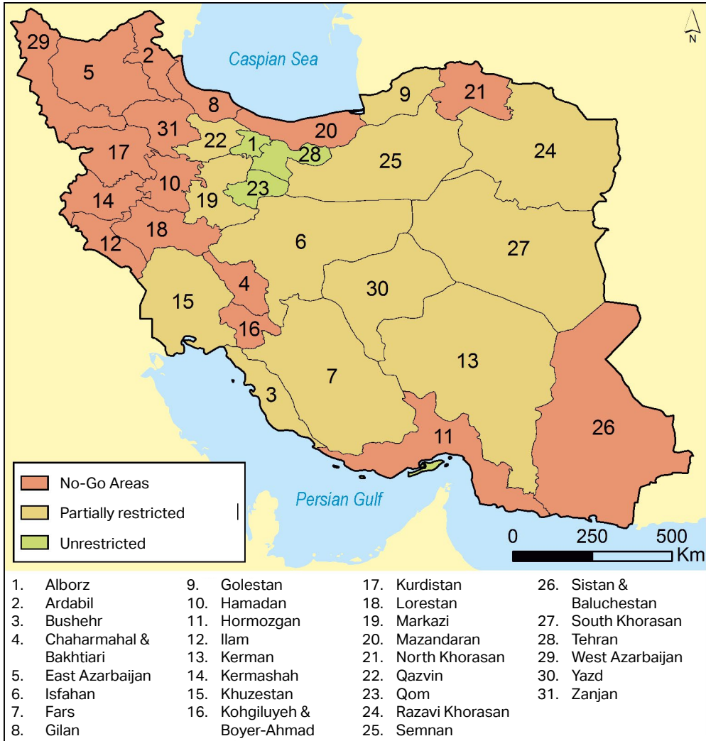
Figure 3.1. Restricted areas (“no-go areas”) in Iran, in which Afghans and other foreign nationals are not entitled to live or travel without specific permission.

It is challenging to study the actual migration of all Afghans in Iran because the majority are irregular migrants about whom the authorities have less information. Seasonal labour migrants (workers) from Afghanistan migrate for weeks to months to specific sites in Iran where their workforce is in demand—for example, during harvest seasons. Migration also affects areas in need of workers in heavy industries and construction, such as large cities.