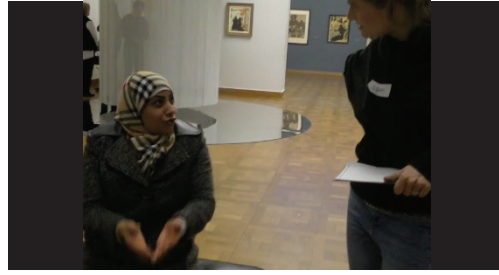
Image 1: On the left side, LIL the participant, on the right STE, the facilitator. LIL and STE are the main participants in this extract.