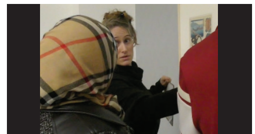
Image 3: STE's gesture of opening hands towards the painting, depicting width. After LIL's turn (Line.9) STE's whole body behaviour, including her facial expression, eyes opened, non smiling mouth, but also orientation toward the painting through width gesture manifests at the same time that she does not understand LIL's previous turn and that she is trying to find the searched word.

Lines 21-22: in response to the word LIL has just proposed (tee, Line 21) to re-initiate the word search, STE proposes a full sentence (Sie sitzt zum Teetrinken,