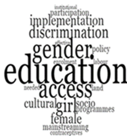
Figure A2. Word cloud of most frequent words in the selected policy documents.