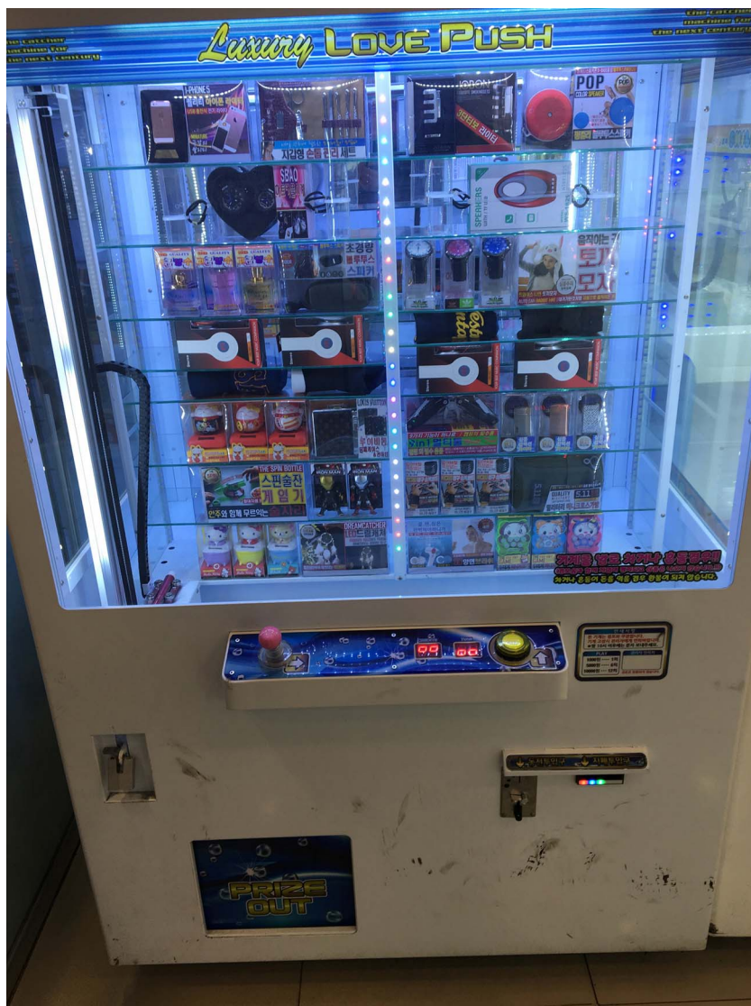
Fig. 6. A toy crane in Daerim (Seoul).

appearance, which indicates a marketing strategy of trying to catch the attention of multiple audiences. It is this evolving hybridity that seems to characterize the toy crane in Korea: a play machine situated at the same time indoors and outdoors, available for human relationships across age and gender groups.