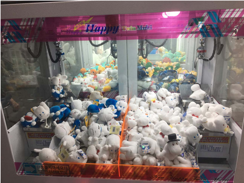
Fig. 7. A toy crane in Dongdaemun (Seoul).

In a different context, that of reality television, a popular talk show Hello Counselor (안녕하세요)—aired by the national Korea broadcast KBS—reflects the everyday lives and relationships of Koreans. Throughout an episode called “My husband’s sickening obsession” (2016), a young couple discusses their relationship. One of the problems is the unemployed husband’s increasing time spent outdoors, including excessive playing of toy cranes. At the time of the show, he has assertedly spend 400 US dollars on doll drawing and won no less than 80 unique plush toys, which he has brought home to his wife (Figure 8). The husband is made fun of for having tried to sell some of the toys, which is clearly against the gender code that would rather position him as a provider who lets the wife have the price. 93 Again, the toy crane is presented as an instrument for the man’s success (“I started it for fun, but I turned out to be good at it”), perhaps offering ego-boosting and satisfaction in a life situation where career opportunities are difficult to pursue.