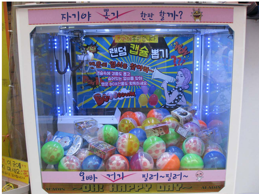
Fig. 4. A toy crane in Gwangbok-dong (Busan).

Recessions and other financial downturns have visible effects also on urban spaces, which we argue further facilitated the toy crane's success in Korea. A common consequence of regional economic struggle is the subsequent increase of unfilled real estate due to the decreased number of financial surplus. In Korea, this resulted in a rapid proliferation of smaller outlets and self-service machines—including the toy crane—whose costs of maintenance and production are minimal. In 2015, at the aftermath of the recent worldwide economic crisis, many vacant spaces in urban centers were thus dedicated to toy cranes. This continued the previously noted trends of bang-based entertainment, manifesting as inbyŏngppopkibang (인형뽑기방, “doll drawing rooms”) or ppopkibang (뽑기방, “drawing rooms”). According to the National Game Rating and Administration Committee, the number of registered doll drawing rooms nationwide jumped from 21 in 2015 to 800 in 2016 and further to 1164 in 2017. 79 The data do not include the stand-alone machines set up near convenience stores, restaurants, and subway stations, let alone multiplexes and other amusement facilities, which are allowed to install up to five toy cranes without registration.