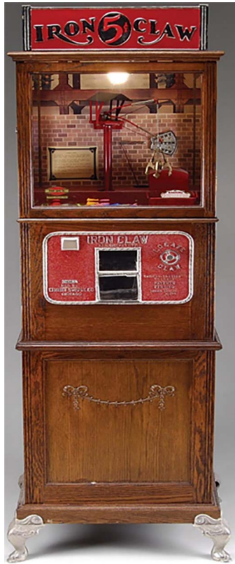
Fig. 2. The Iron Claw (1928). Pinball Repair.

The U.S. court, in the decisions it has approved, has ruled that three elements are necessary for machines to be considered as gambling devices—(1) risk of something of value (consideration), (2) a prize, and (3) chance, a risk of loss or winning. There is no question but that two of the foregoing three requisites of a gambling device are present in each illustration presented by you. The important matter of inquiry therefore revolves about determination of the presence or absence of the third requisite, namely, chance, or substantial degree of skill as referred to in the cases. [ . . . ] If both elements of skill and chance are present, the test is whether the element of chance predominates over the element of skill. 10