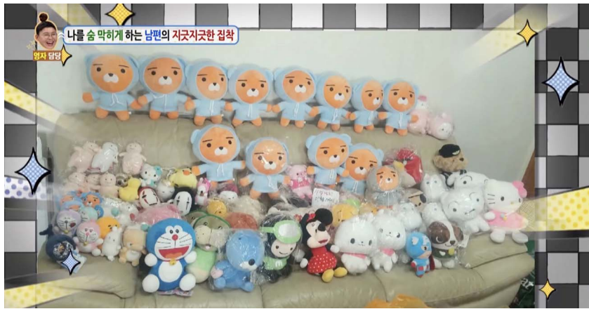
Fig. 8. The husband's toy crane price collection from Hello Counselor (2016).

film series. Although K-dramas have increasingly penetrated international entertainment markets since the late 1990s, their rapid development has also led to risky industry models that often systematically seek contemporary trends with hopes for instant success. 94 According to Oh's review of the modern K-drama industry, the extremely slim chance of making a hit and “the blind expectation of popularity is nothing more than the creation of risks, that is, equivalent to the practice of gambling.” 95 Ironically, the calculated introduction of the toy crane—a gambling machine itself—into multiple recent K-dramas speaks accurately for the industry's opportunistic search for popular, trending references (preceding the recent success of Squid Game [오징어 게임], which similarly utilizes common knowledge of children's games).