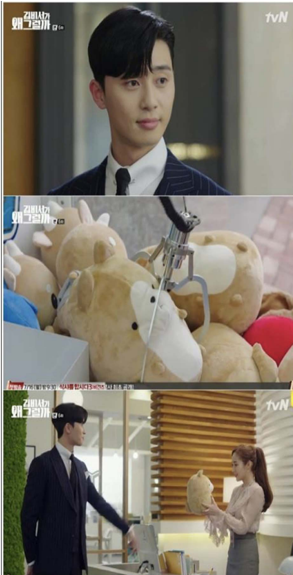
Fig. 9. Scenes from Korean TV drama What's Wrong with Secretary Kim (2018).

The toy crane K-drama representations, which tend to follow the narratives of the above examples, maintain the status quo of dominant Korean gender roles. 96 A typical instance of such scenario involves a heterosexual young couple engaged with the machine; the male standardly