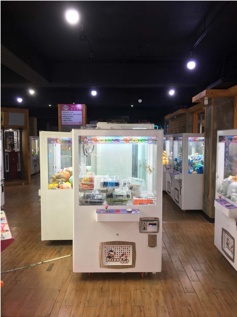
Fig. 5. Ppopkibang in Sinchon (Seoul).

communicates a higher-stake gambling element: this is one of the more expensive cranes (1000 won), but victory will be rewarded with a more expensive prize, too. On the other hand—despite offering the usual pool of various toys—most of this machine's prizes (pocketknives, watches, etc.) seem to be entirely unrelated to its romanticized