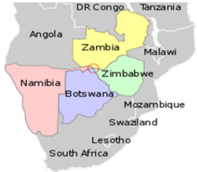
Figure 1: Location of Botswana, Namibia, Zambia, and Zimbabwe in Africa (Quadripoint, 2022).

In Table 1, it is apparent that these four neighbouring SADC countries have a wide range in their populations. Botswana and Namibia have very small populations and, similarly, small population densities, while the Zambia and Zimbabwe populations and population densities are about six times larger.